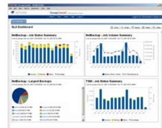
Drag-N-Drop Dashboard Reports