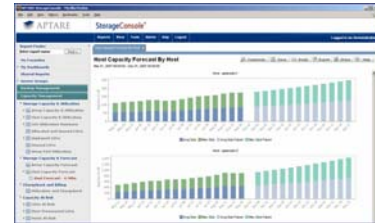
Capacity Forecasting Reports